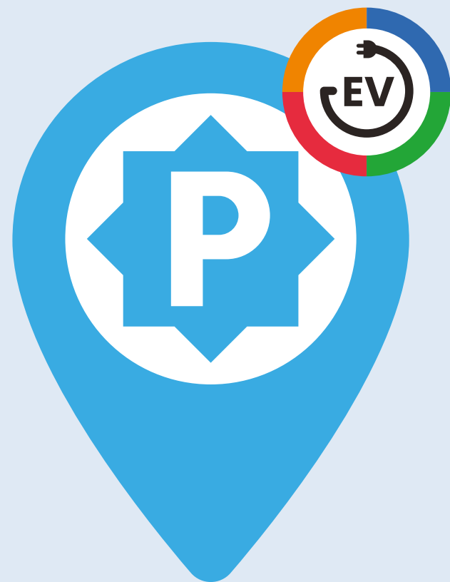
Park Access EV